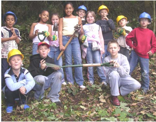
Children planting trees at volunteers' open day

Carrs Woodland is a joint project between local residents, Bath & North East Somerset Council, Wildspaces, Envolve and Newton Mill Camping Park. The project is led by the Carrs Woodland Forum, a group of local people who look after the site and run various events and activities.