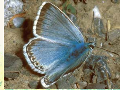
Chalkhill Blue Butterfly