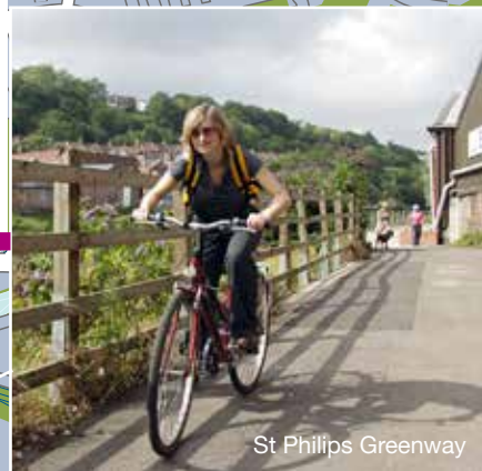
St Philips Greenway